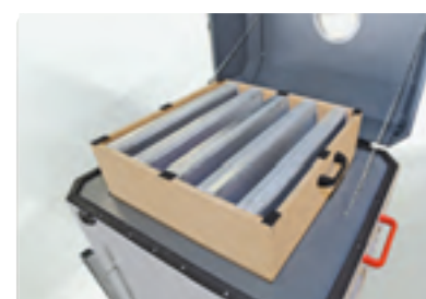
Active carbon filter