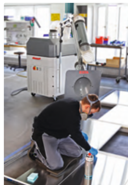
VACUMAT with extraction arm to extract odors at gluing work stations

Its excellent filtration performance, compact design and low operating costs make VACUMAT a reliable asset in your production facilities.