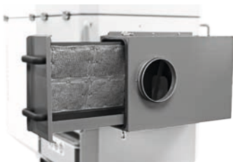
The sides of the spark pre-separator serve to dispose of residue.