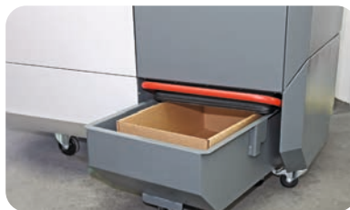
The mobile 24 gal dust collection drawer can also be transported using a lift truck or fork lift.