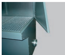
Side panel swung back for larger work pieces